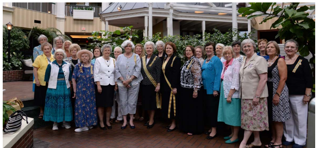
Tennessee Daughters attending the TSSDAC 2015 Summer Board meeting in Brentwood.