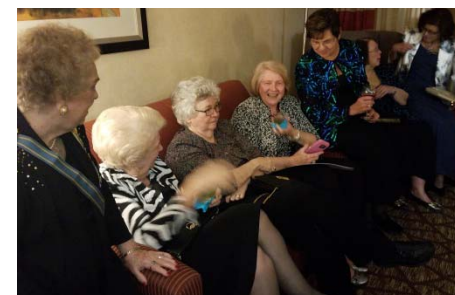
Left, members and guests chatted in the National President's Suite following the Candlelight Supper.