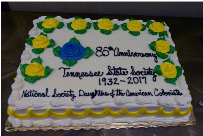
Our Tennessee State Society celebrated 85 years since our installation in Chattanooga in 1932.